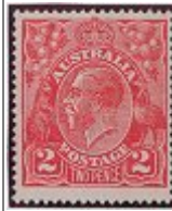
Table (4) KGV issues watermark sideways and other items