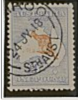
Table (3) KGV issues watermark inverted