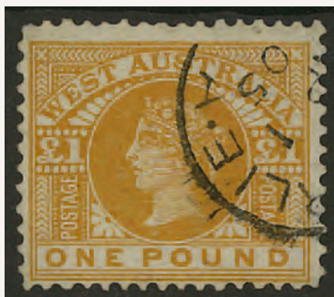
Issued 4 years after the Queen died.

A person licking a 1d or 2d Queen Victoria stamp onto every letter they mailed for 12 years after she had died, as there was no other design choice, seems incredibly bizarre. If you lived in Victoria or Queensland or South Australia, that was your only option.