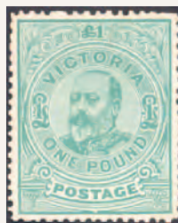
The King turns GREEN

So very clearly new designs COULD be created, engraved, approved and printed with quite commendable speed back then - if the PO wished to act. Victoria and Tasmania both also issued KEVII postal stationary. KEVII died in May 1910. The 'Commonwealth Stamp Design Competition' was not announced until 1911.