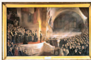
The Big Picture

Every state Postmaster General surely was thinking in 1910: 'if I issue a set of attractive stamps depicting this new King, my Knighthood/OBE/MBE may well be assured'. Trust me - that 'Gong' syndrome was not an uncommon expectation for senior Bureaucrats in Commonwealth countries.