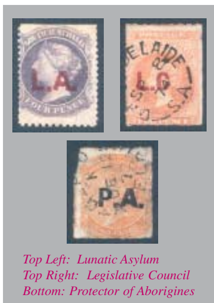
Top Left: Lunatic Asylum Top Right: Legislative Council Bottom: Protector of Aborigines

WHATEVER you pay for these "Departmental" stamps now will seem a bargain in a few years' time is my predication. In 25 years of stamp dealing I have handled only a few dozen, and if demand takes off these will quickly be worth 5 times present levels.