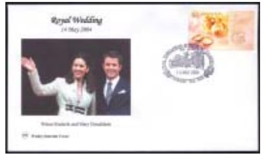
One of the set of 7 covers

I understand Stamp News Mail Order is running an ad for their small stock of these in this magazine, and as they only have about 50 sets of 7, if you need this set do NOT hesitate to secure it soon. There was NO other issue from Australia to mark this historic wedding.